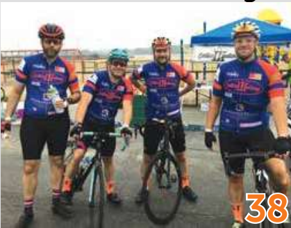
Team Geshher Rides for a Cause