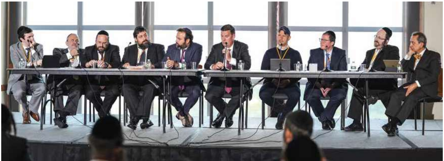
Brass Tacks Q&A panel session

T he Winning Edge 2018 was met with waves of positive feedback.